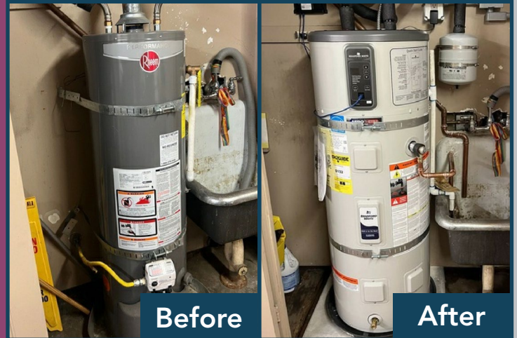
Before and after installation photos at the Marina Community Center in the City of Seal Beach.

In 2023, 18 agencies leveraged SoCalREN's expertise to install heat pump water heaters across multiple facilities. Through incentives provided by SoCalREN, additional TECH Clean California funding, and Water Heater Warehouse procurement, this collaboration brought participating agencies reduced project costs and supported the completion of their respective installations.