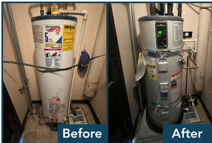
Before and after installation photos of the City of Seal Beach City Hall.