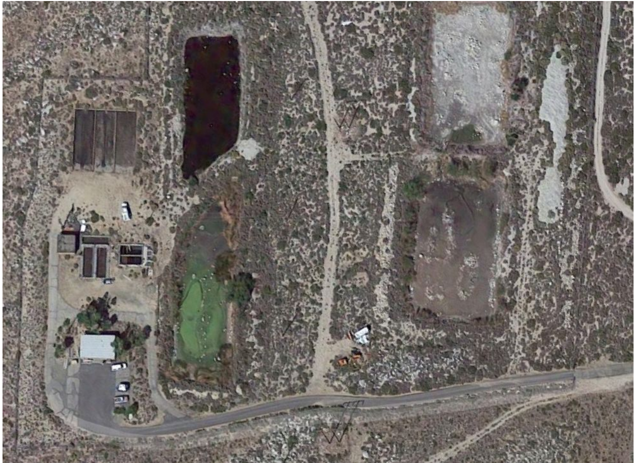
Figure 1: Aerial view of the wastewater treatment plant