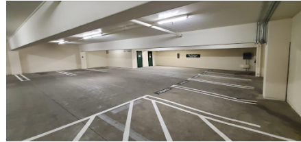
Pictured: Before and after upgrades at Cardiff Parking Structure Level 1

SoCalREN offers multiple programs to meet your agency's energy efficiency and sustainability needs. In February 2020, Culver City completed a project through SoCalREN's Metered Savings Program at their Cardiff Parking Structure. The 5-level parking garage is located in the City's popular downtown area and only took one week to complete all the energy efficiency upgrades. The lighting retrofit upgrades were financed through the City's internal funding and took only 1 year to complete from start to finish. Overall, the project resulted in over $142,000 in lifetime cost savings and brought significant benefits to the public by making the parking areas brighter and easier to see.